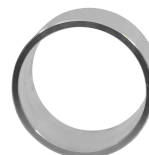
SL R sleeve

For detailed information, please visit roxtec.com .